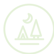
NATURE AND THE OUTDOORS