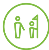
YOUTH LEADING, ADULTS SUPPORTING