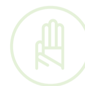
PROMISE AND LAW